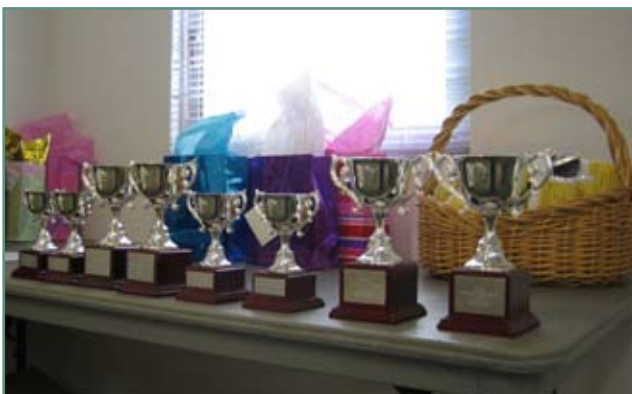
Coveted Toastmaster bling